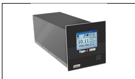
Tiger-i 2000 NH 3

Tiger Optics introduced the world's first commercial "Continuous Wave Cavity Ring-Down Spectroscopy" (CW-CRDS) analyzer in 2001. Today, our instruments monitor thousands of critical points for industrial and scientific applications. They also serve the world's national metrology institutes, where they function as transfer standards for the qualification of calibration and zero gases, as well as research tools for such critical issues as global warming and urban air quality.