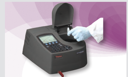
Orion AquaMate Spectrophotometer Ideal laboratory instrument for extensive, full wavelength measurement of wastewater.