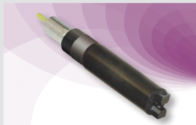
AquaSensors DataStick Suspended Solids Turbidity System