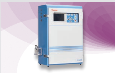
Orion 3106 COD analyzer for Chemical Oxygen Demand On-line COD optimized for wastewater measurements.