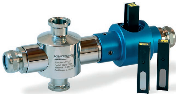
Integrated NIST validation accessory

Industrial grade measurement cells with scratch resistant sapphire windows, contain no electronics or moving parts making them ideal for both ordinary and hazardous area use. A validation & calibration accessory traceable to NIST standards is available to assure measurement confidence while saving valuable time and resources.