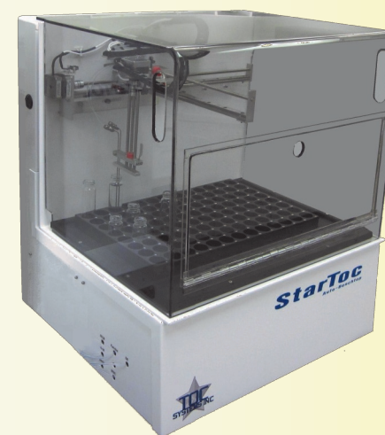
Auto Lab TOC

Depending on your environmental obligations, you can choose between these 4 techniques or combine them.