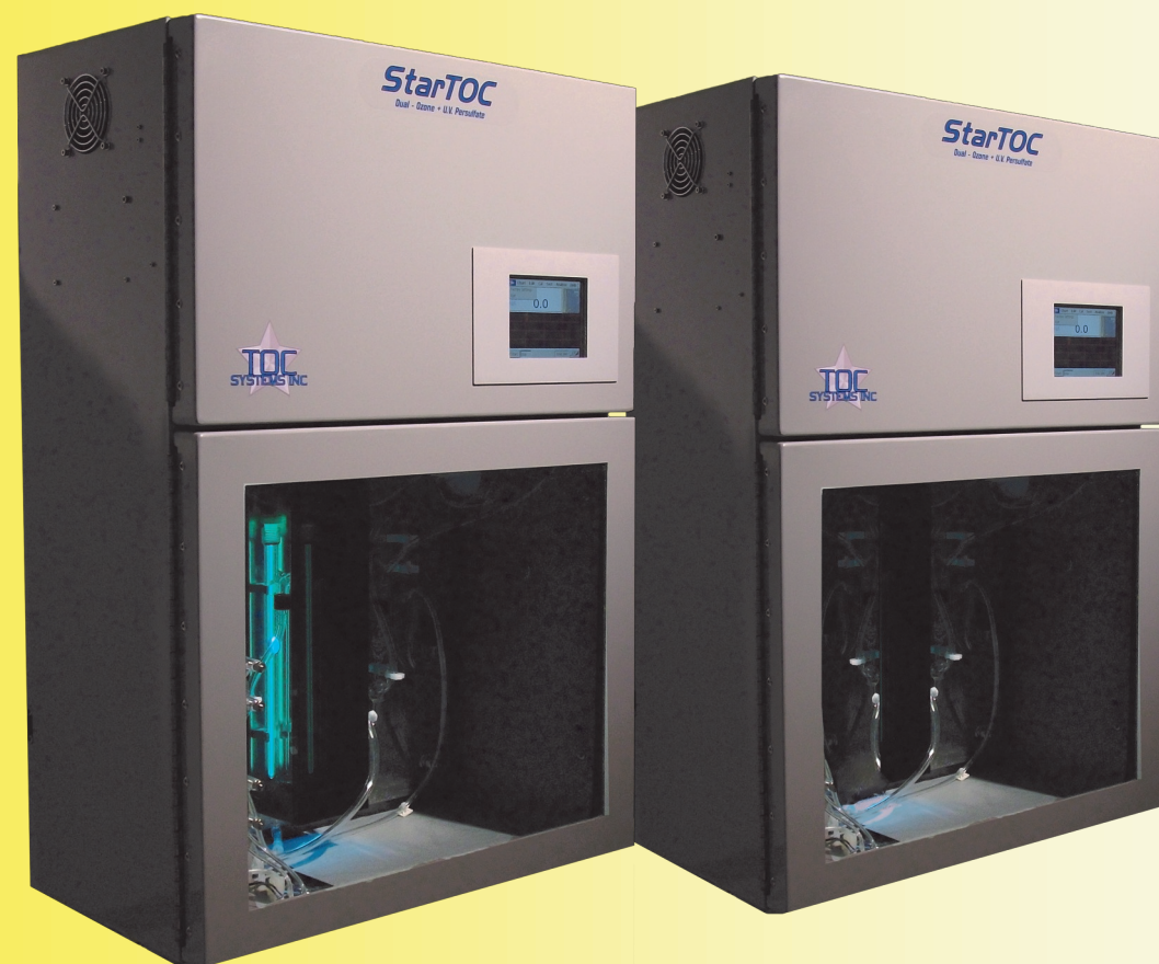
Continuous TOC True