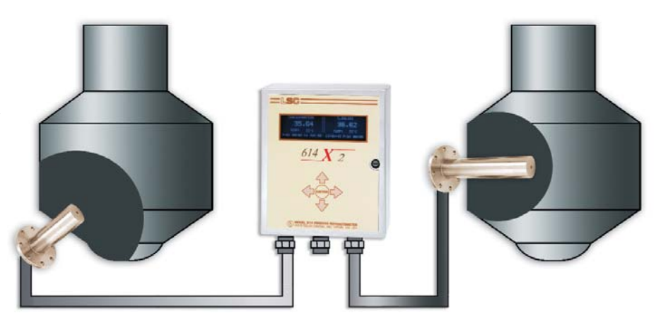
*Note: Model 614 X2 is designed to support two sensors from the same processor.

Measuring supersaturation and controlling the seed point of the vacuum pan/crystallizer is an ideal measurement for the Model 614. LSC's insertion probe is the most versatile sensor on the market as we are the only manufacturer that has a "truly" extended sensor. All types of vacuum pans/crystallizers operate slightly different with their own circulation patterns; LSC has recognized this and responded to the industry's demands. The success of this application is directly linked to the placement of the sensing prism inside the pan. Pan operators/plant engineers can specify the exact Insertion Probe length their application requires (up to 500 mm length). Our ability to provide a probe/sensor specific to your needs makes LSC the preferred Process Refractometer for the Sugar Industry.