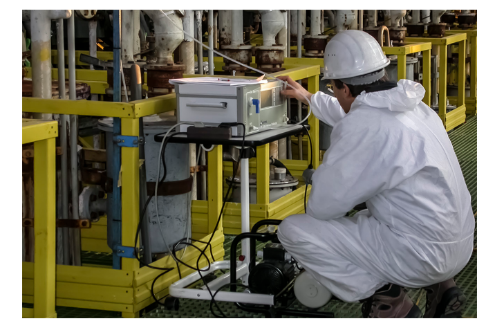
MC-3000 in operation: Calibration of a mercury monitoring system