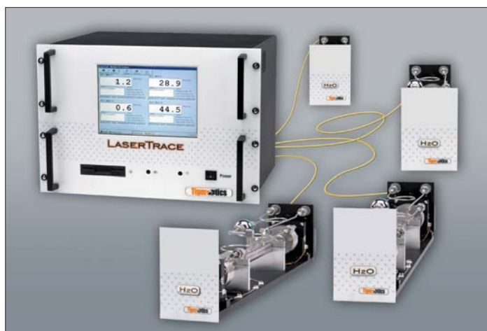
Pinpointing the source of moisture in gas lines with instruments like Tiger Optics' LaserTrace is critical to low-temperature epi.