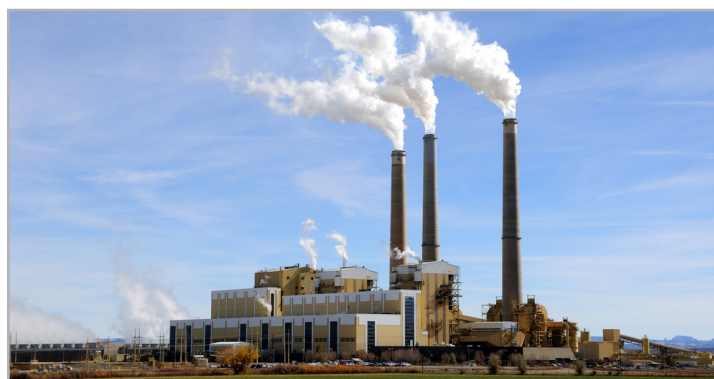
Fig. 2 Coal-fired power plant

and report the level of the gas present in stack emissions and to ensure that steps are taken to guarantee that emissions fall below the specified limits. This may require the emitter to either refine their process, via the use of cleaner fuels, for example, or to add abatement technology downstream of the industrial process to reduce emissions of HCl.