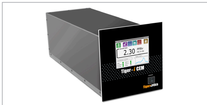
Fig. 1 Tiger-i CEM

HCl is generated by multiple industrial processes, with combustion of coal and oil for household and industrial power generation as the primary source. Here, chlorides present in the fuel are converted to HCl in the combustion process and emitted with other by-products. In addition, industrial processes emit HCl as a result of chlorides present in raw materials that are converted to HCl during production. In cement production, for instance, raw materials, including calcium carbonate, silica, clays, and ferrous oxides, all contain chlorides, resulting in generation of HCl.