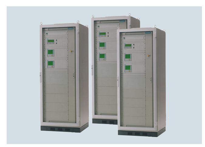
The Set CEM 1 is a standardized system specially for monitoring the emission components in flue gases.