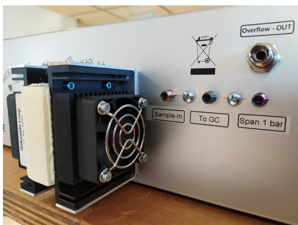
Synspec cooled loop, at rear plate.