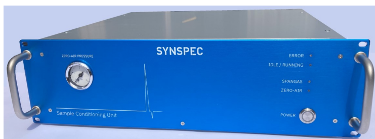
Synspec Cooled-SCU, front view.