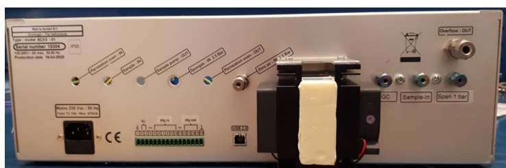
Synspec Cooled-SCU, rear view.